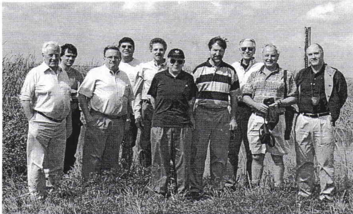
Sport and Recreation Navigation Commission

They produced gate parts for the Peoria Locks well below the time frame quoted by any other supplier and provided a value engineering service that substantially reduced the cost of the parts and future maintenance costs. The Rock Island District ordered new linkages for the upper connections on the miter gates at one of the Illinois River locks. Through the Arsenal's value engineering efforts, the parts were reduced from 24 pieces to 4 pieces with a substantial cost savings. The new design greatly reduces the maintenance requirements as well as the initial installation efforts. The parts were the anchor bar assemblies for the miter gates at one of the Rock Island District locks. The design changes were coordinated with Rock Island District Engineering Division and received their approval.