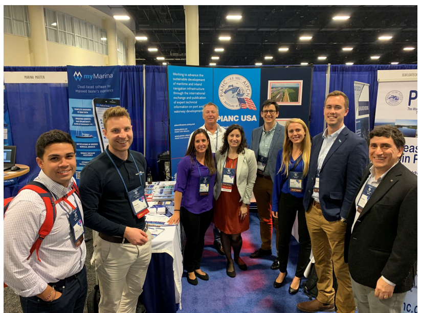
PIANC USA booth during the YP Happy Hour sponsored by Moffatt & Nichol.